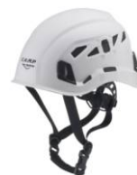
7 - White