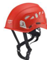
1 - Red