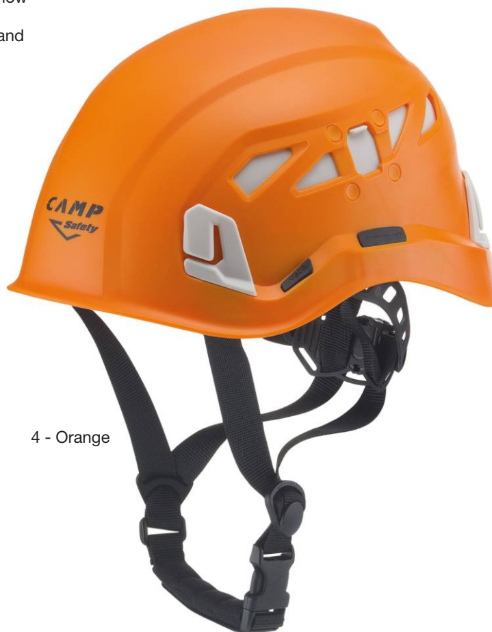
4 - Orange