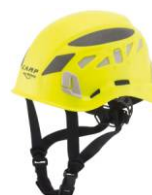
3 - Fluo yellow / Reflective grey