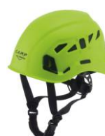
6 - Green