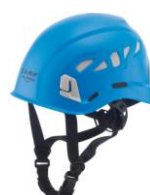
2 - Light blue