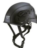
8 - Black